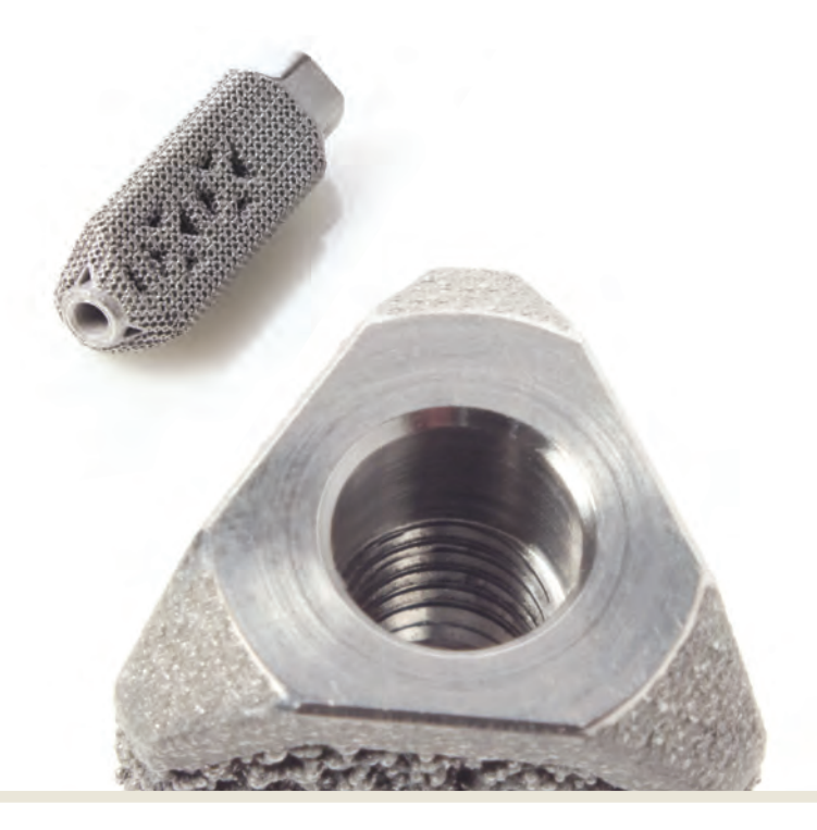
Printed spinal fusion cage