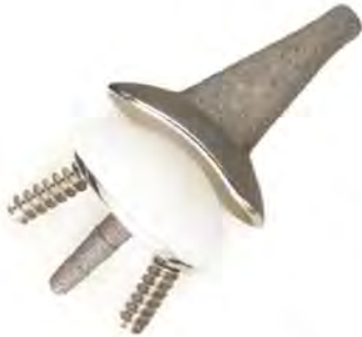
Total joint implant – UHMW polyethylene and cobalt chrome; 5-axis milling, EDM, Swiss turning, and polishing.