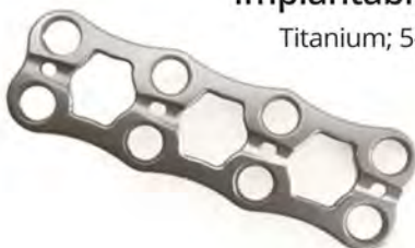
Implantable fixation plate – Titanium; 5-axis milling; anodized.