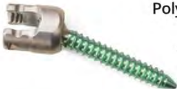
Polyaxial spinal screw – Head on 13-axis lathe; screw on a Swiss lathe with thread whirling.