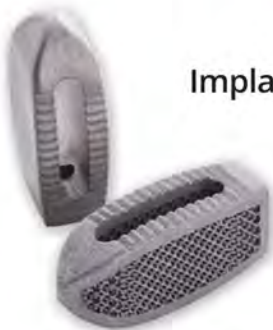
Implantable interbody cage – Titanium; Direct Metal Printed.