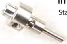
Implantable pacing component – Stainless steel turned and threaded on Swiss turning center; EDM produces slot.